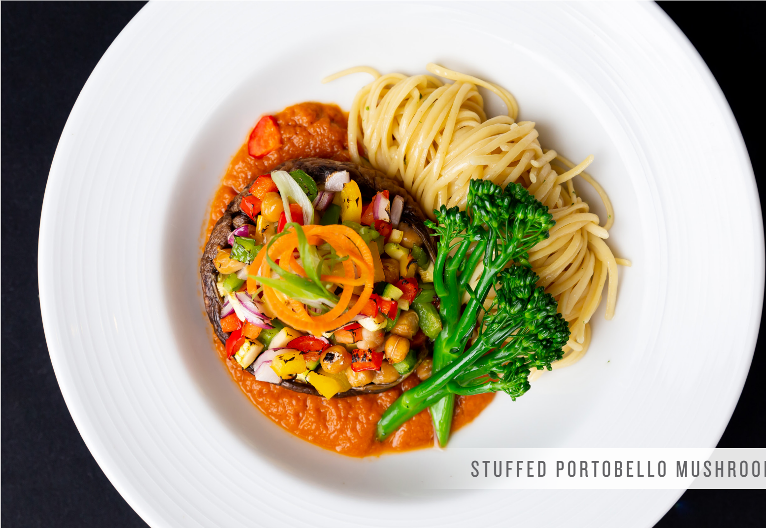
STUFFED PORTOBELLO MUSHROOM

Eggplant, Tomatoes, Zucchini, Yellow Squash, and Onions. Layered in a Tomato Marinara. Served with Pasta and Seasonal Vegetables