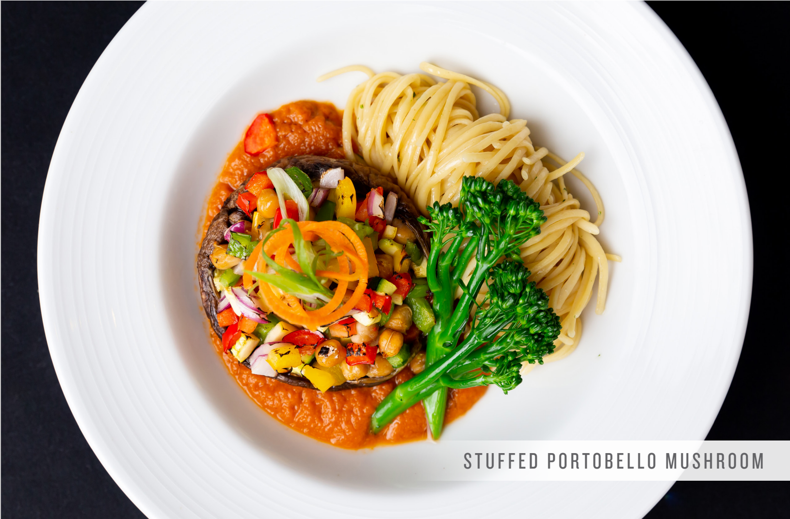
STUFFED PORTOBELLO MUSHROOM

Ratatouille - $28.00 Eggplant, Tomatoes, Zucchini, Yellow Squash, and Onions. Layered in a Tomato Marinara. Served with Pasta and Seasonal Vegetables