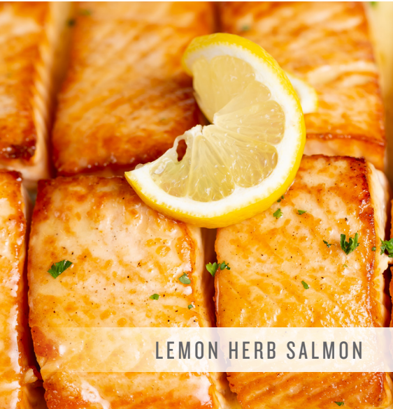
LEMON HERB SALMON